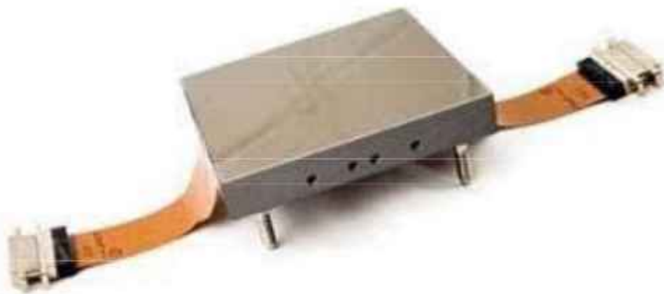
Fig1: 6k x 6k CCD, SiC buttable package with Flexi connector (pictorial representation)

This document outlines the specifications and requirements for the procurement of CCD Detector Controller Electronics. The electronics must be specifically designed to control a 6k x 6k CCD array specifically CCD-231-C6